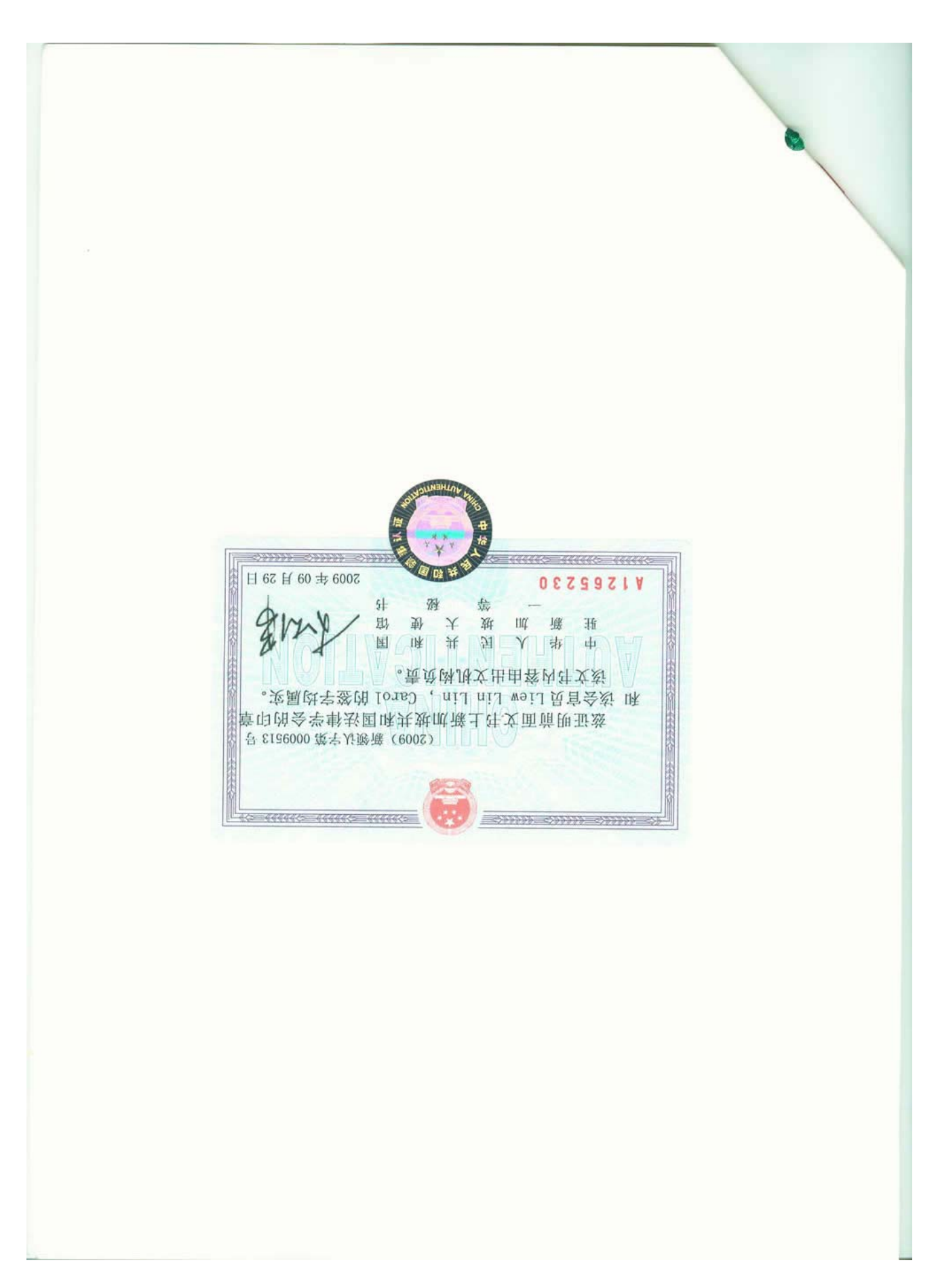
Step 3, China Embassy (Singapore) legalization